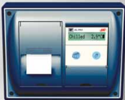
TKDL-PRO Model C