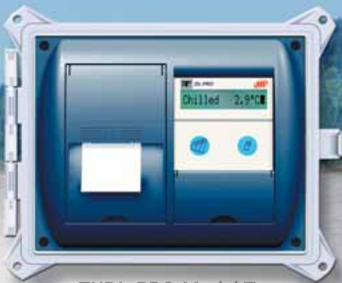
TKDL-PRO Model T

High performance printing data logger with temperature alarm monitoring