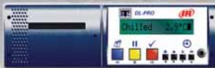
TKDL-PRO Model R